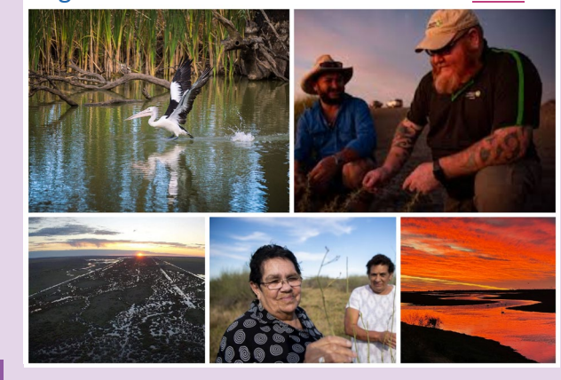
Figure 2: Images of Gayini Nimmie-Caira. For video footage of this internationally-significant wetlands from the air visit here.

The conservation of biodiversity and cultural heritage, water delivery and hydrological restoration were objectives that both governments had for the property and as a result a series of legal and management constraints and protections were required. This included the development of a Land and Water Management Plan and environmental water easements to allow environmental water delivery across the property. These restrictions and protections, while allowing for sustainable uses, aligned well with the ambitions of the consortium.